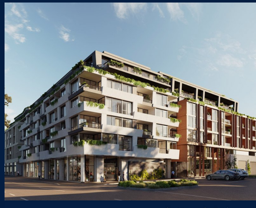
Spencer: 2 - Bedroom