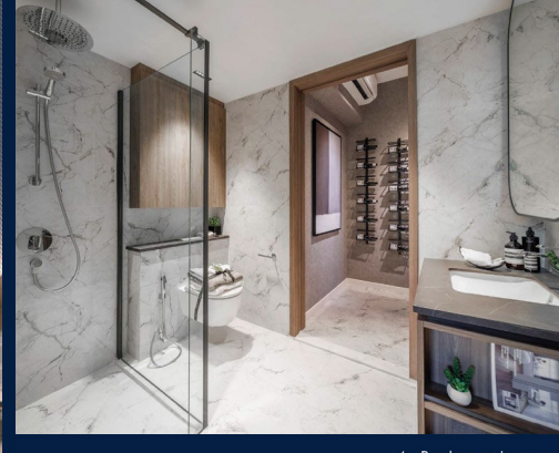
4 - Bedroom Luxury