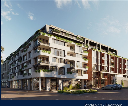
Roden: 2 - Bedroom