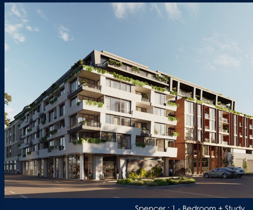
Spencer: 1 - Bedroom + Study